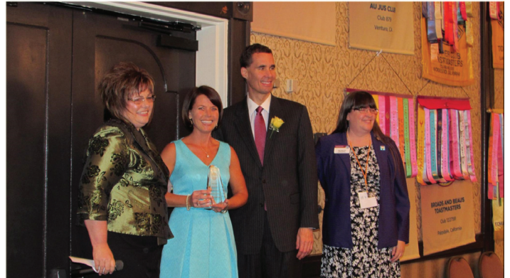
2nd Place International Contest