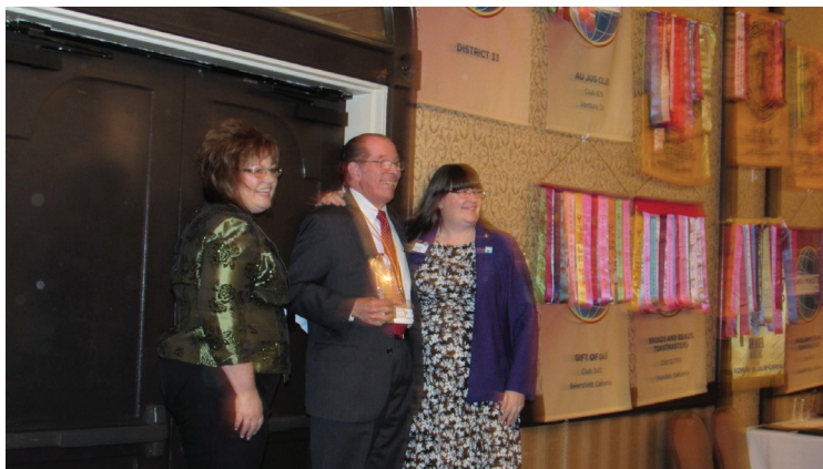
1st Place Tall Tales Contest