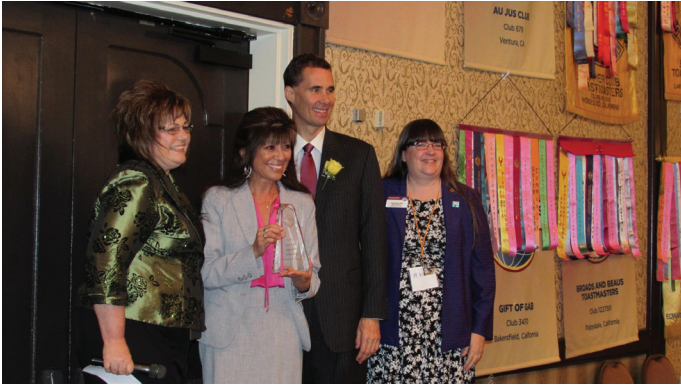
1st Place International Contest