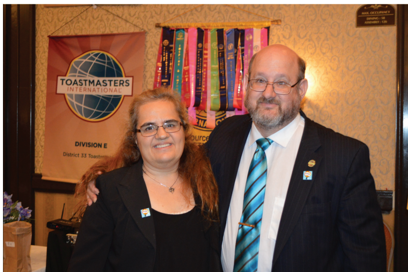
2015 - 2016 incoming Division B Governor