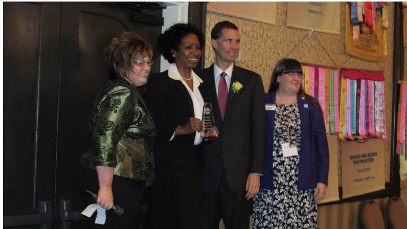
3rd Place International Contest