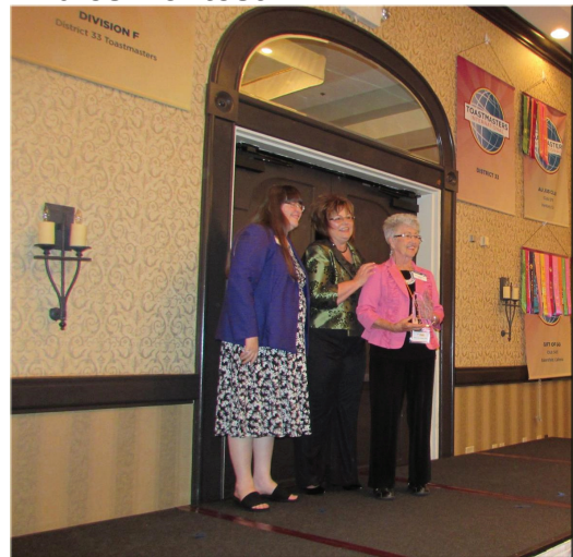
2nd Place Tall Tales Contest